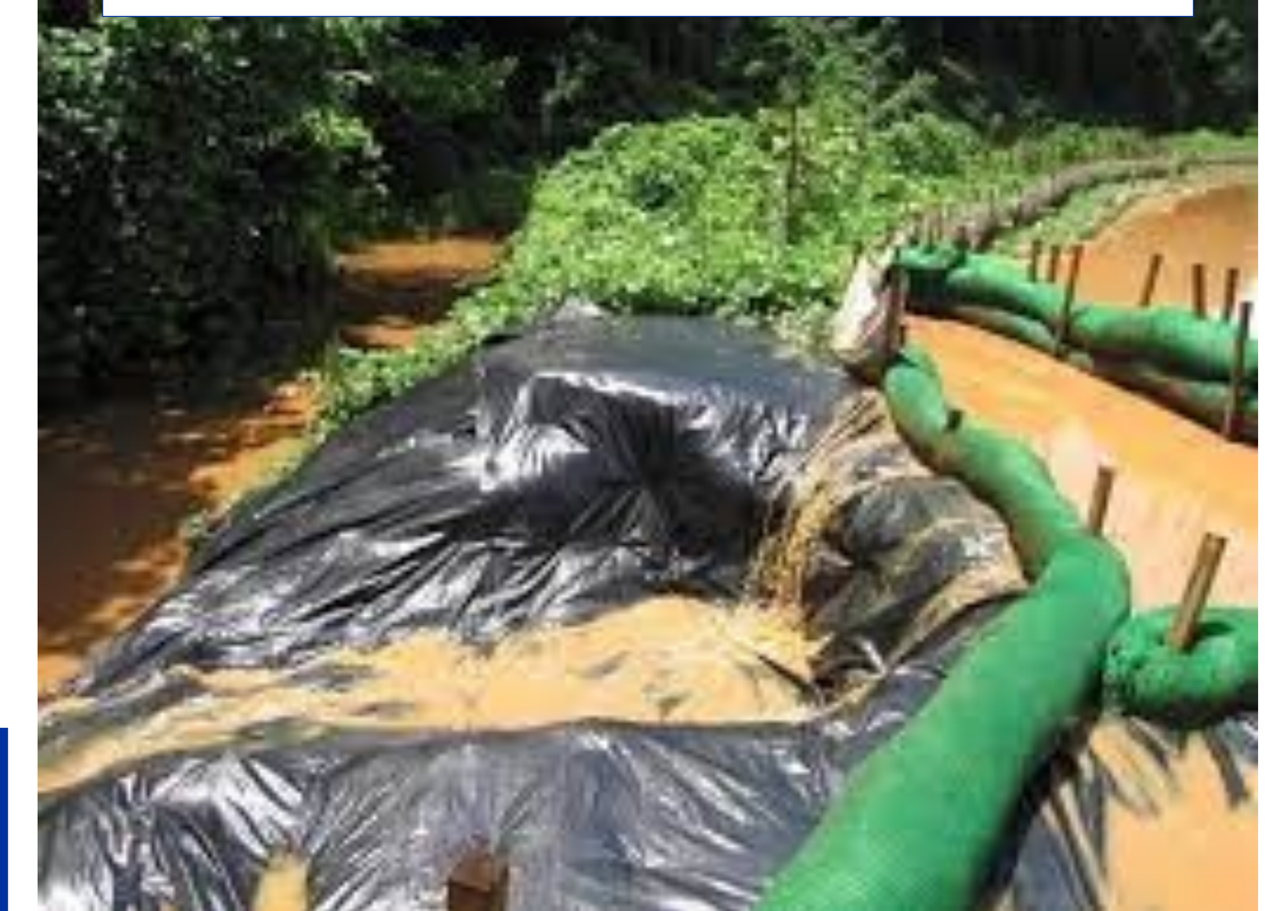
Figure 2(Above). Stormwater Runoff. This image is a picture of poorly-controlled stormwater runoff at an MVP construction site (10).