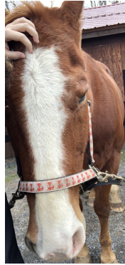
Figure 1: A therapy horse at Heartland Horse Heroes