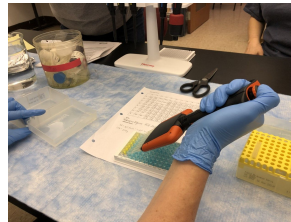
Figure 2: This is the resulting plate from the cortisol assay.