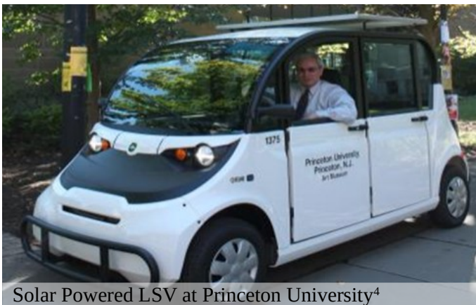
Solar Powered LSV at Princeton University 4

Bottom left: The Princeton University Art Museum owns two Low Speed Vehicles (LSV) charged by solar panels for travel around town and on campus. These are similar to Longwood's golf carts, but are more environmentally friendly.