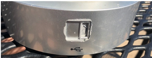
Top: a solar umbrella on Brock Commons. Bottom: a USB port on the base of the umbrella.

The umbrellas' batteries charge with five hours of sunlight and hold enough power after dark to charge fifteen phones 21 In full use during the academic year, these umbrellas potentially could supply between 20 and 25 kWh of power each, only between 0.0001% and 0.0002% of campus electricity use 2 . Though these numbers may be small, these solar umbrellas are important for engaging students in using solar energy.