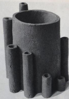
143 B 14