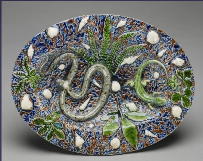
Bernard Palissy About 1510-1580