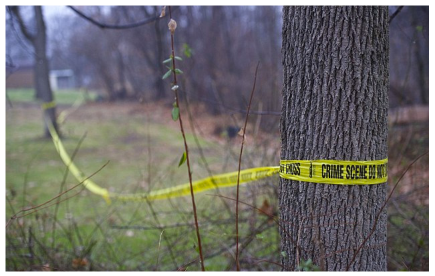
Crime scene located within the woods behind the girl's grandmother's house

On March 6th at 11:38 a.m., police responded to a noise compaint located at 1901 Smoketree Lane. Upon arriving, officers found the dead body of Wolf Robertson (32) who appeared to have died due to trauma in the abdominal area.